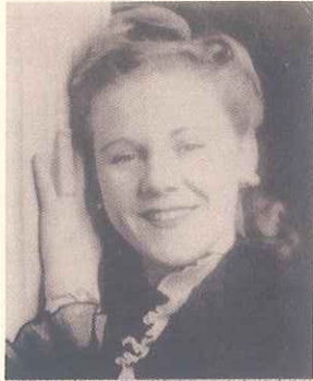
VIOLA GREGG LIUZZO

1925-1965 Killed by Klansmen while transporting marchers, Selma, Ala.