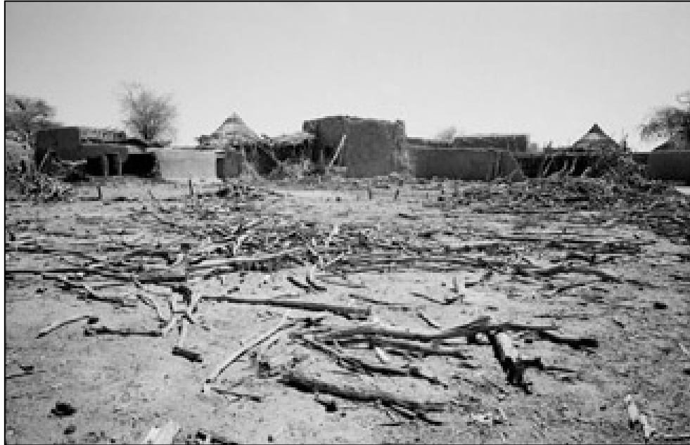
The remains of the village of Jijira Adi Abbe in Darfur, western Sudan, after the government attack.

Violence and destruction are raging in the Darfur region of western Sudan. Since February 2003, government-sponsored militias known as the Janjaweed have conducted a calculated campaign of slaughter, rape, starvation and displacement in Darfur.