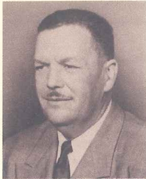
VERNON DAHMER 1908-1966 Black community leader killed in Klan bombing, Hattiesburg, Miss.